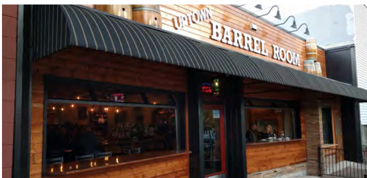
Uptown Barrel Room