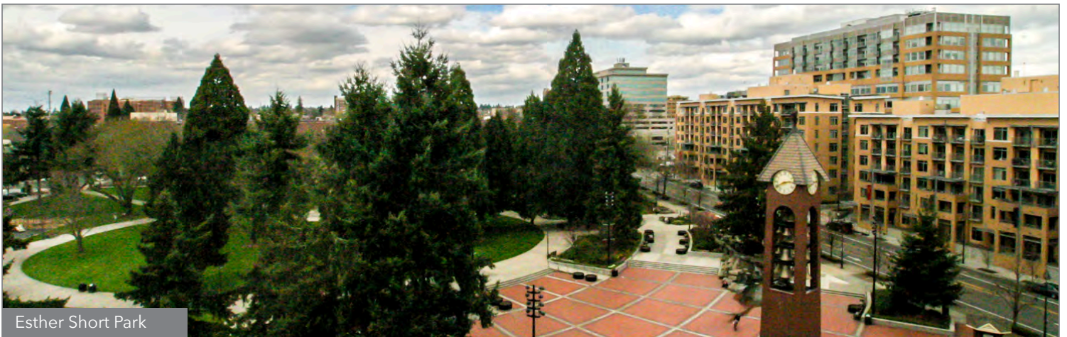
Esther Short Park