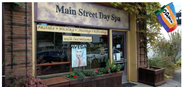
Main Street Day Spa