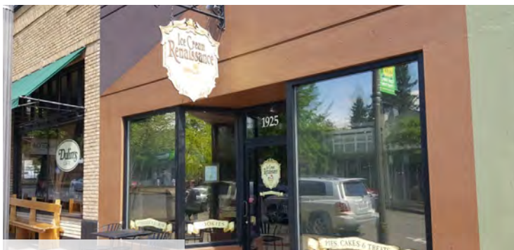
Ice Cream Renaissance