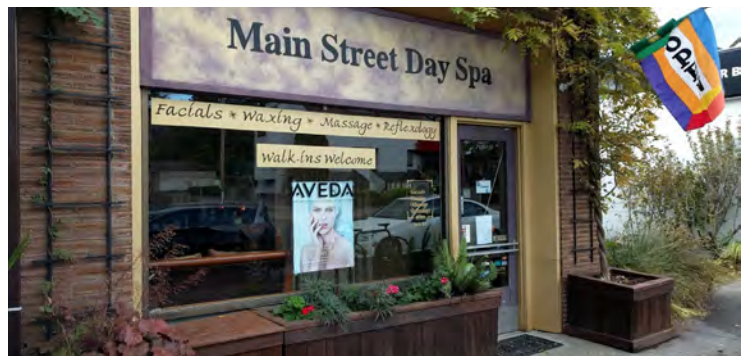
Main Street Day Spa