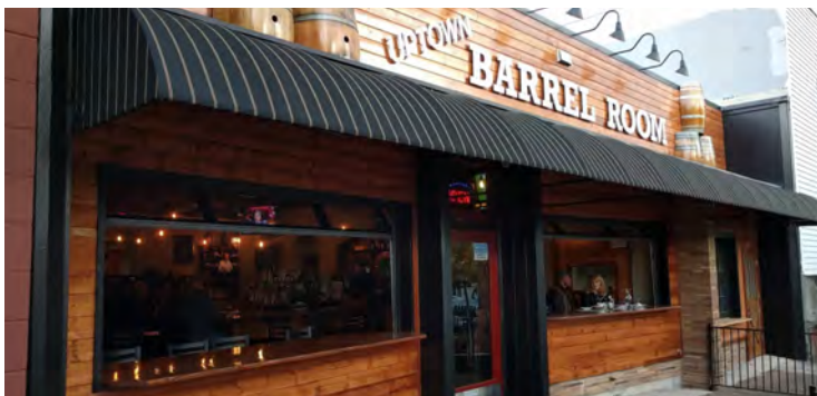
Uptown Barrel Room